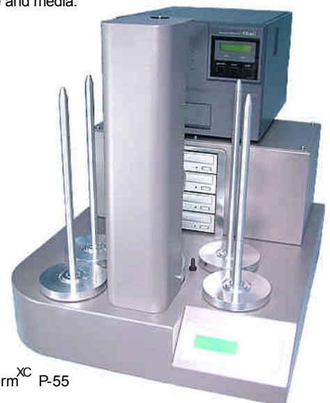
Storm XC P-55

DiscPilot Networking Software (compatible with Windows XP Pro) Mechanical or Vacuum Picker Mechanism OptiPrinter Pro Teac P-55 Prism Plus! Panther