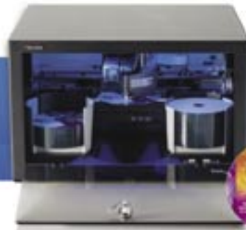
Bravo™ XRP DISC PUBLISHER

Bravo XRP has the same rugged, heavy-duty, rack-mountable chassis and cabinet as the Bravo XR with dual DVD/CD drives. It automatically burns and prints up to 100 CDs or DVDs at a time.