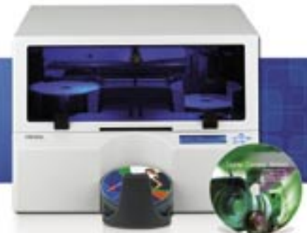
Bravo™ XRn DISC PUBLISHER

Bravo XRn is a high-performance, enterprise-class machine that's been designed for use in the most demanding, "mission-critical" environments.