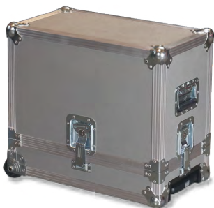
CASE-PD4 MIL SPEC Transport case