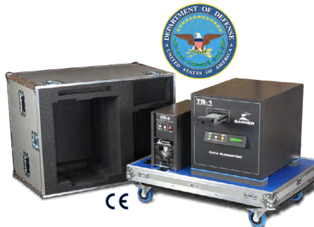
Mobility Package DDM-14

Configure a system to match your needs. Our optional MIL-SPEC transport case with built-in wheels makes it easy to transport the PD-4 to offsite data locations. To ensure data can never be retrieved, pair the PD-4 with our NSA/CSS EPL-listed TS-1 degausser, feature-filled HD-3WXL degausser, or budget-friendly HD-2 degausser.