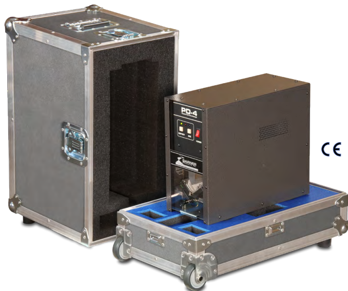
PD-4 in MIL SPEC transport case