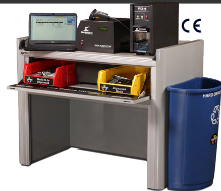
Complete Degauss Destroy Recycle Workstation DDR-34 with optional SCAN-1 (laptop not included)