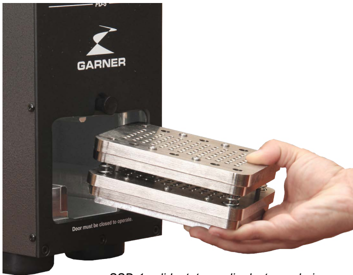
SSD-1 solid-state media destroyer being inserted into the PD-5 destruction chamber