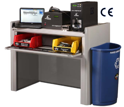
Complete Degauss Destroy Recycle Workstation DDR-35 with optional SCAN-1 and SSD-1 (laptop not included)