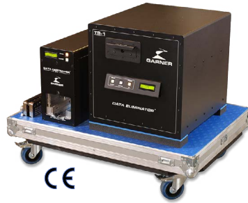
Mobility Package DDM-15 with SSD-1

The PD-5 operates as a standalone unit or as part of a complete degauss-and-destroy system, when paired with our NSA/CSS EPL-listed TS-1 degausser, feature-filled HD-3WXL degausser or budget-friendly HD-2 degausser.