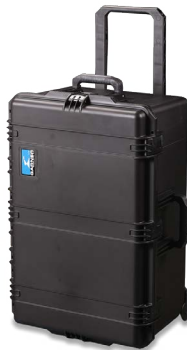
MIL SPEC shipping case