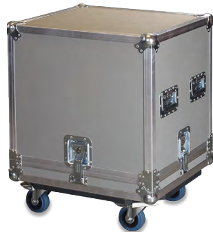
CASE-HD3 MIL SPEC Transport case