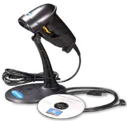
SCAN-1 Media Destruction Report Generator