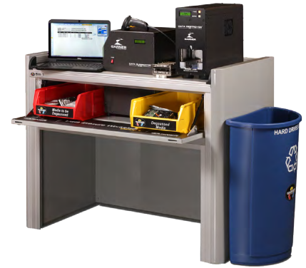
Complete Degauss Destroy Recycle Workstation DDR-35SSD with optional SCAN-1 (laptop not included)