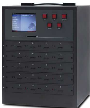
CPY220MSD 20 microSD Port Flash Duplicator