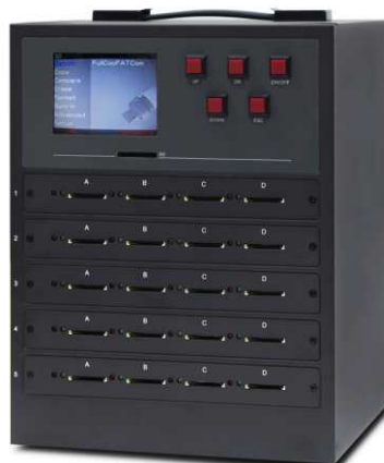
CPY220SD 20 SD Port Flash Duplicator