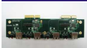
CPY220 4-port USB IO Module