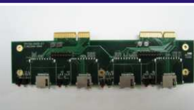
CPY220 4-port microSD IO Module