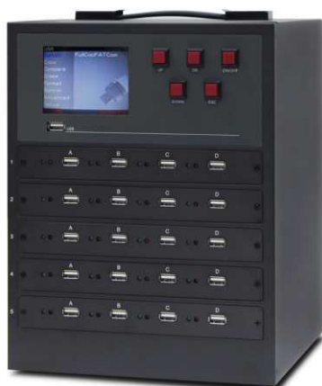
CPY220USB 20 USB Port Flash Duplicator