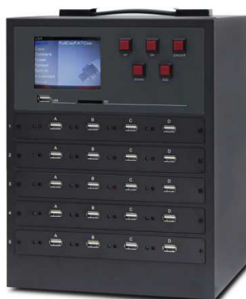
CPY220COMBO 20 USB/SD/microSD Port Flash Duplicator